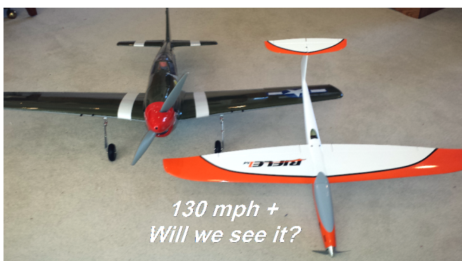
RIFLE 1M – Ready for Test Flight

Below are pictures of my works in progress. What are you working on? Let us know, send a picture.