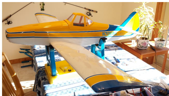
PIPER PAWNEE – Winter Rebuild Project

The Dec BFMS meeting is scheduled to be held at the Beltzville Bar and Tavern at the cross roads of Pohopco & Penn Forest Rd (the road to our field). It's been a very competitive race for the 2015 club officers. Your vote may make the difference! Please come join us to elect the officers for 2015.