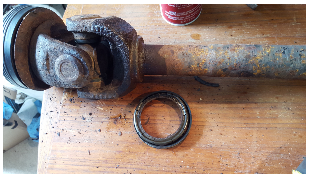
A REALLY POOR SEAL DESIGN