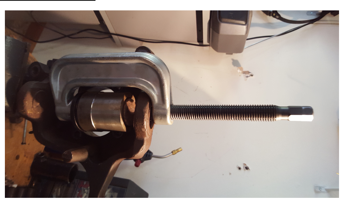
I AM NOW THE PROUD OWNER OF A NEW BALL